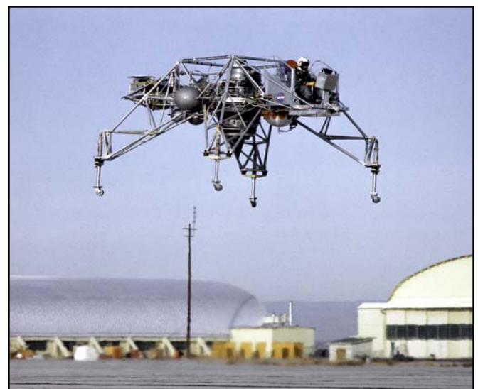
The Lunar Landing Research Vehicle for astronauts